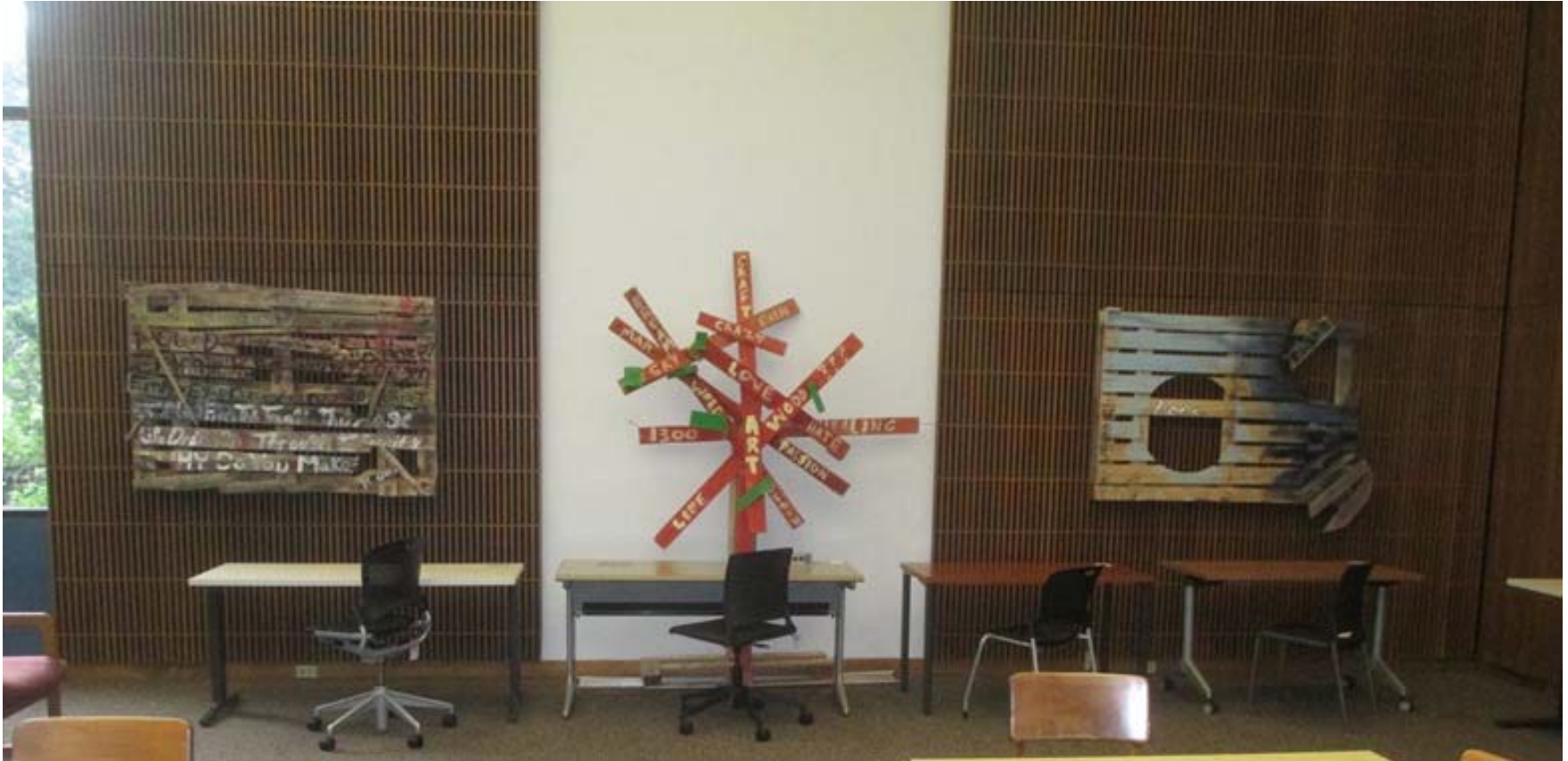
Spring 2015 Furniture Fair