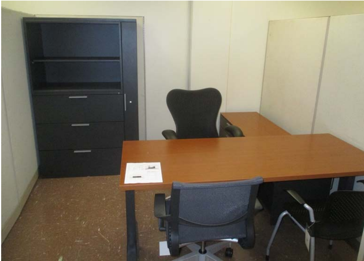
Spring 2015 Furniture Fair